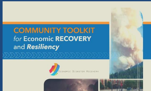
COMMUNITY TOOLKIT (CANADIAN VERSION, 2019)