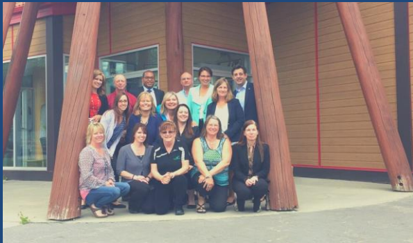
COMMUNITY ECONOMIC RESILIENCE WORKSHOP